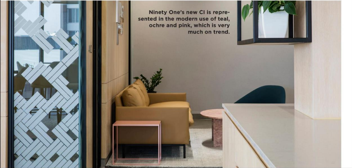
Ninety One's new CI is represented in the modern use of teal, ochre and pink, which is very much on trend.