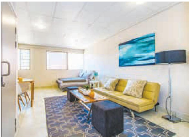
There is a need for affordable, yet quality accommodation in the inner city.